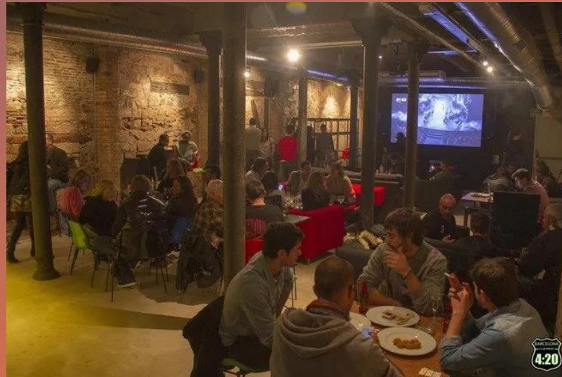
Cannabis Cafes AKA Drug consumption rooms