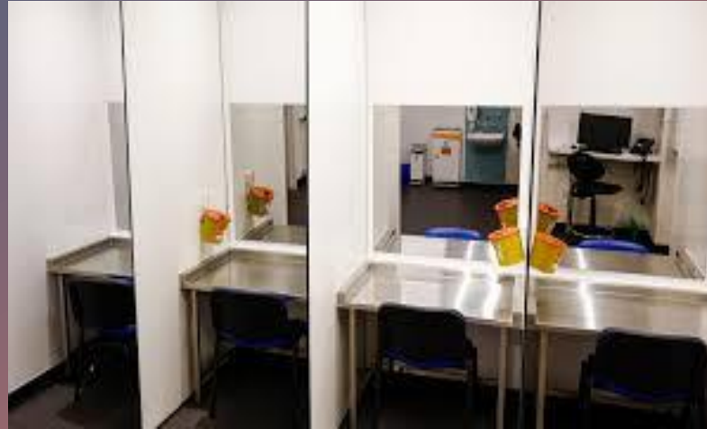
Cannabis Cafes AKA Drug consumption rooms