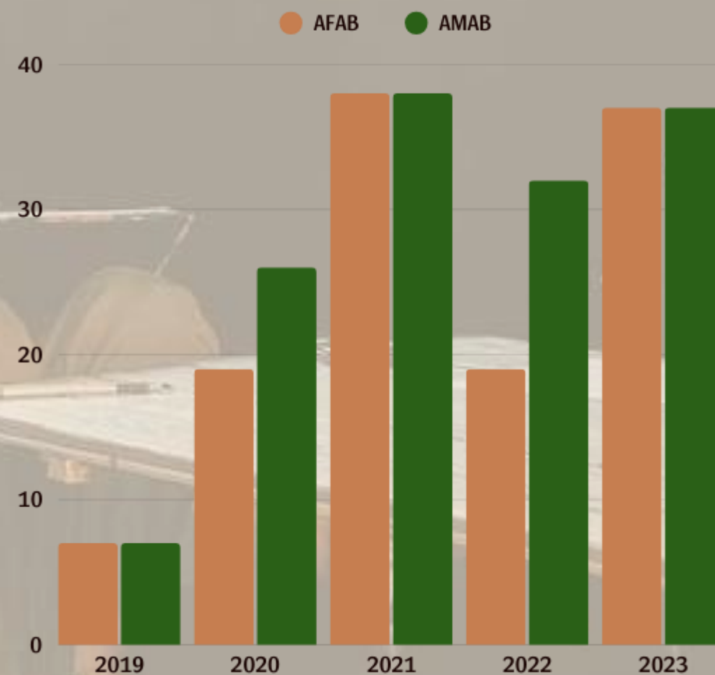
FATAL YOUTH FENTANYL POISONINGS, SK